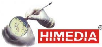
Plate Count Agar (Standard Methods Agar)