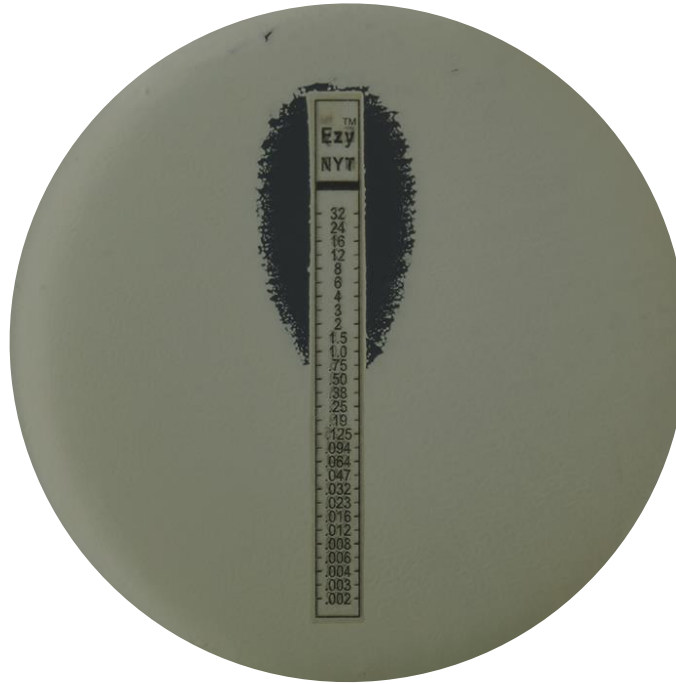
Fig. 1: Candida tropicalis ATCC 750 MIC: 0.75 mcg/ml